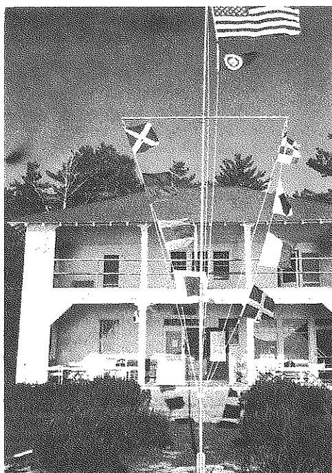
O.T.Y.C. IN GALA DRESS